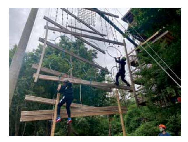
"I learned to always try things because I was scared and nervous to do the zipline but after I did it I had a fun time and wanted to do it again."

"This leaf we saw smelled like peppermint and when we saw a tree that people had carved into we learned it's not good for the tree because its like your skin and it could get infected"