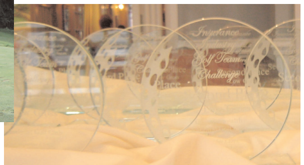
2004 Golf Team Challenge Trophies